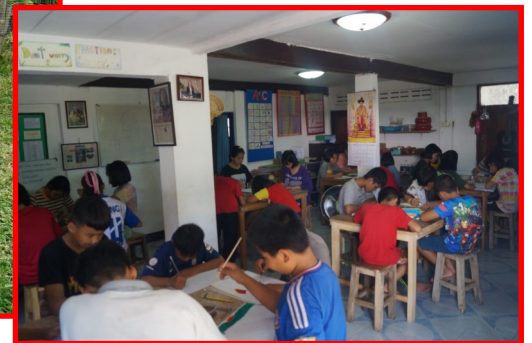
Art class with the Director

If you would like to VISIT, FUNDRAISE, VOLUNTEER or DONATE please email us at Ayui.foundation@gmail.com www.ayuifoundation.org